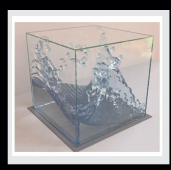
Flow Simulation with GNS Gonzales et al., 2020